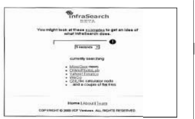
Figure 4. The InfraSearch service was online for a short time. A user entered a search word or words and the results from geographically separate Sewers were displayed.