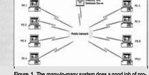
Figure 1 The many-to-many system does a good job of providing access to files on peers. However, when network traflic is heavy, system performance can degrade.

Few-to-few peer computing allows users to create a vitual "space" without having to involve a system administrator or invoke complex commands. Any user, regardless of location and type of Internet connection, can enter asecure virtual space and interact. Functions are controlled by the participants. Tyical activities include shared Web browsing,